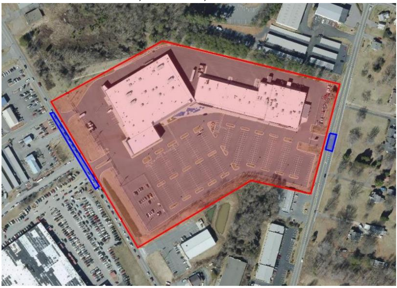
Transportation Technology Center Geography 4255 North Patterson Avenue, Winston-Salem, NC 27105